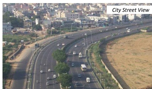
City Street View