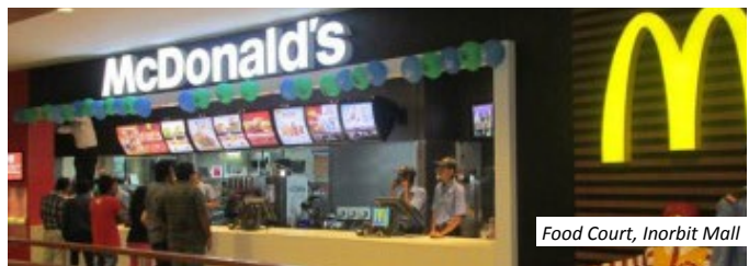
Food Court, Inorbit Mall