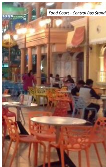
Food Court - Central Bus Stand