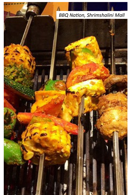
BBQ Nation, Shrimshalini Mall