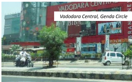
Vadodara Central, Genda Circle

VadFest (Vadodara International Art and Culture Festival), organized by Art and Culture Foundation Vadodara under the aegis of Vadodara International Art and Culture Festival Authority, Government of Gujarat and Gujarat Tourism, is an initiative to promote and restore Vadodara as a cultural capital of India. It is one of India's biggest art and cultural festivals. Vadodara is famous for its rich heritage, fine arts, performing arts, iconic architecture, industrious nature and academic infrastructure. The first such festival was on 23–26 January 2015. AR Rahman, Sunidhi Chauhan, Sonu Nigam, Hariprasad Chaurasia were some of the renowned artists who performed during the festival.