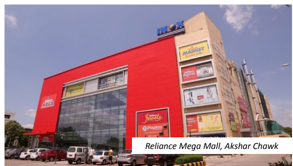
Reliance Mega Mall, Akshar Chawk