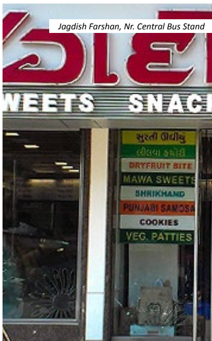
Jagdish Farshan, Nr. Central Bus Stand