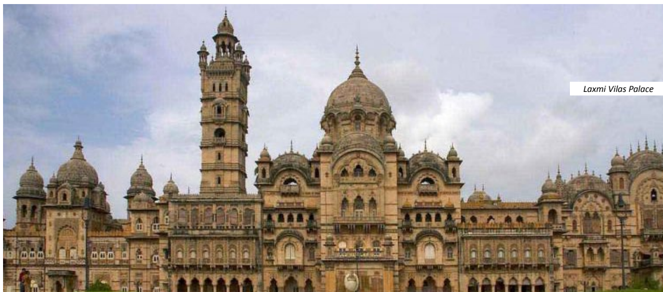
Laxmi Vilas Palace

You could also view this interesting video about Vadodara on YouTube @ https://www.youtube.com/watch?v=5d4XTiUXfdQ