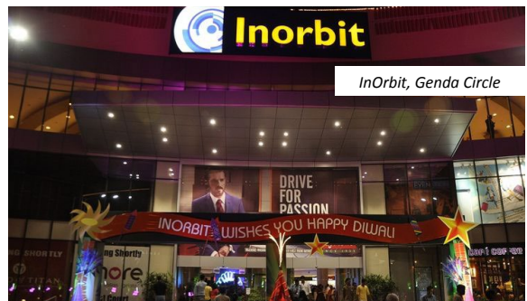
InOrbit, Genda Circle