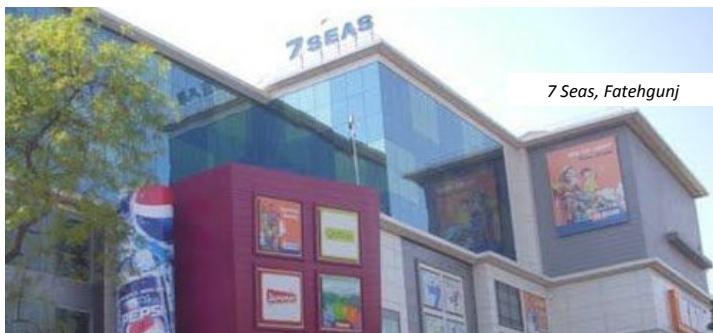
7 Seas, Fatehgunj